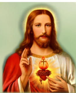
Sacred Heart, Bedford