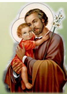
St. Joseph, Villisca