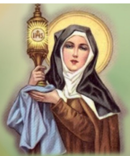
St. Clare, Clarinda